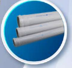
SWR Pipes & Fitting