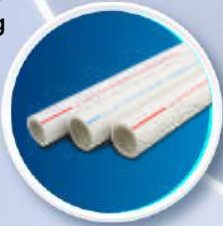
uFLO UPVC lead free Pipes and Fitting