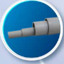
Agriculture Pressure Pipes & Fitting