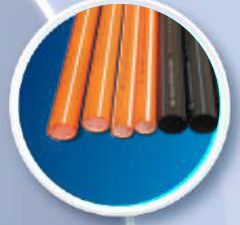
PLB HDPE Duct